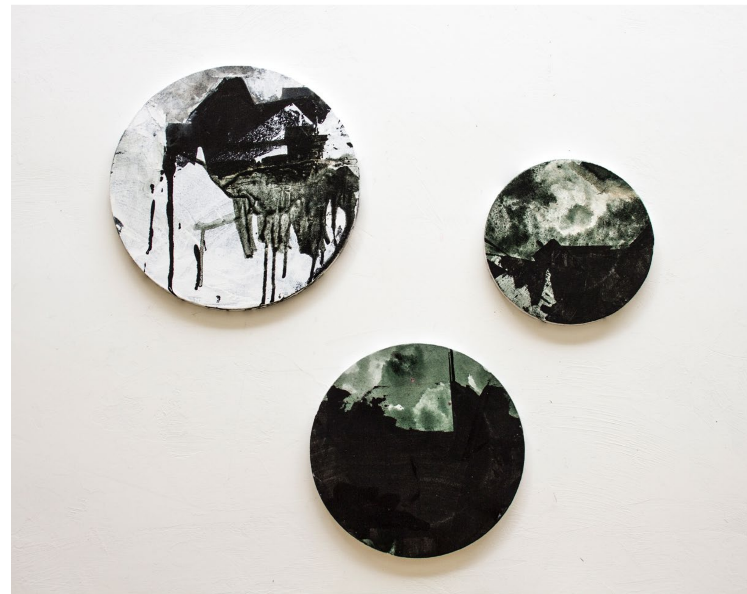
Above clockwise: Round Landscape #04 Acrylic on canvas, 12x12 " / 30x30 cm, 2018 Round Landscape #03 Acrylic on canvas, 8x8 " / 20x20 cm, 2018 Round Landscape #02 Acrylic on canvas, 10x10 " / 25.5x25.5 cm, 2018