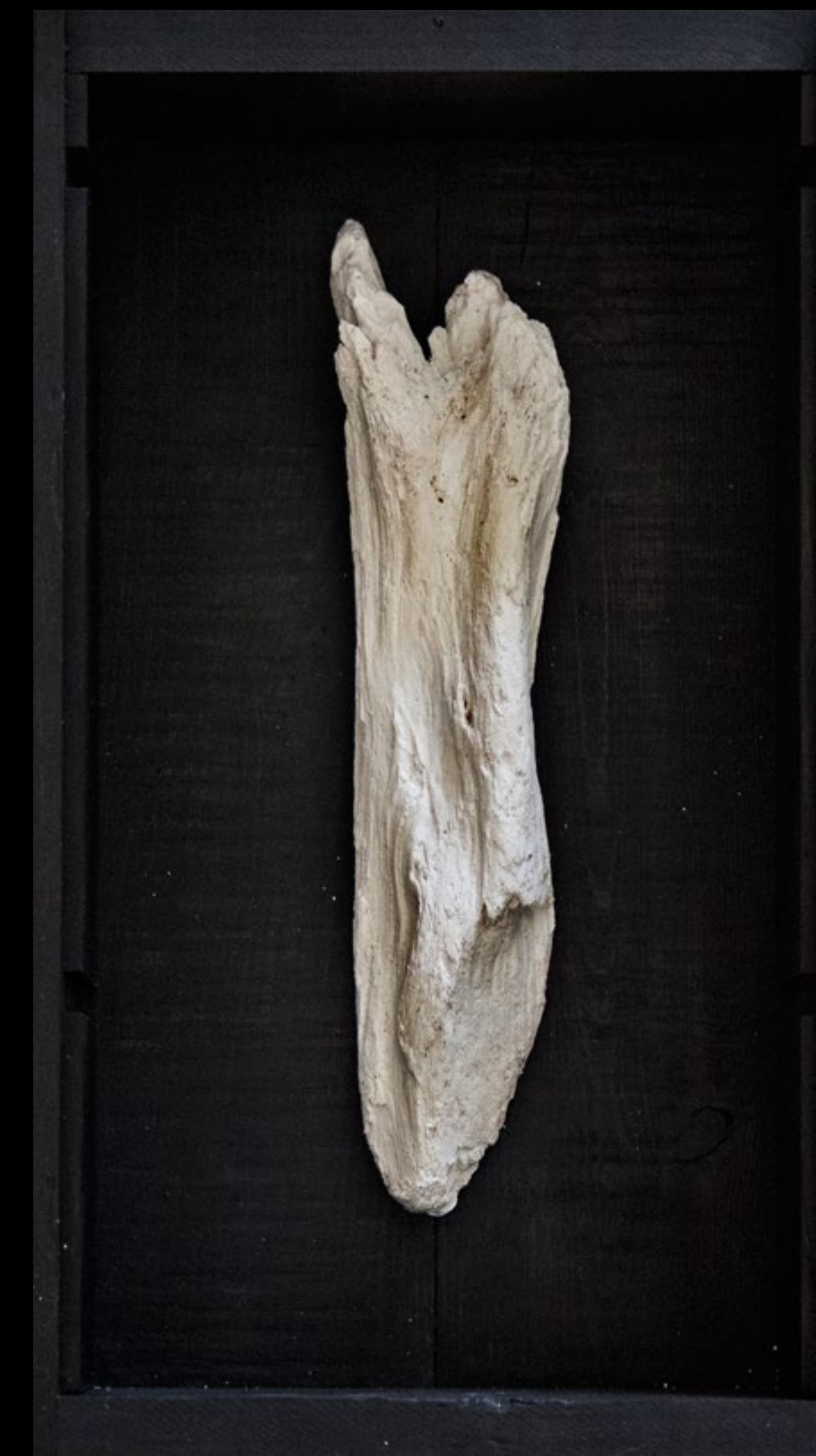
Petrify #04 / white Plaster cast in a wooden box, 10x15 " / 25x38 cm, 2018