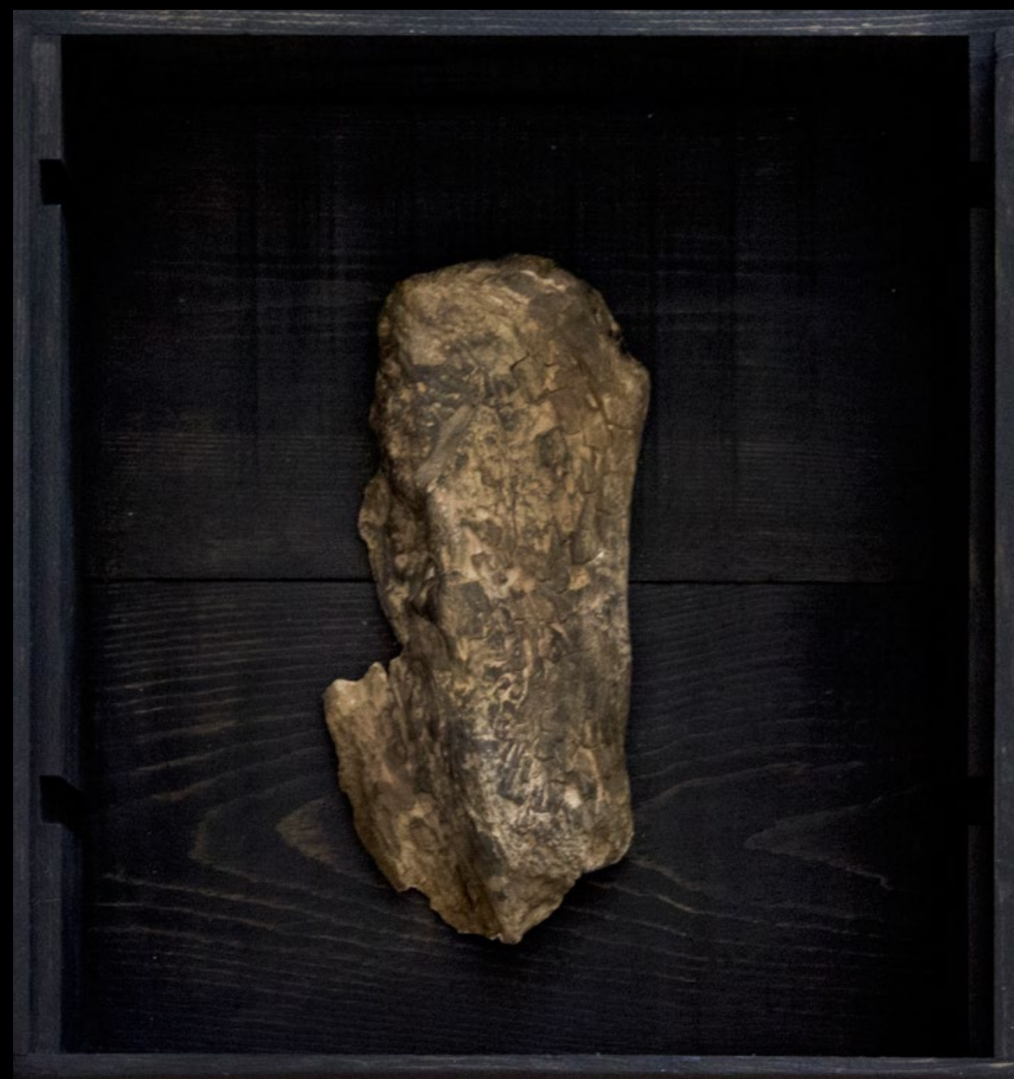
Petrify #05 , Plaster cast in a wooden box, 12x12.75 " / 31x35 cm, 2018