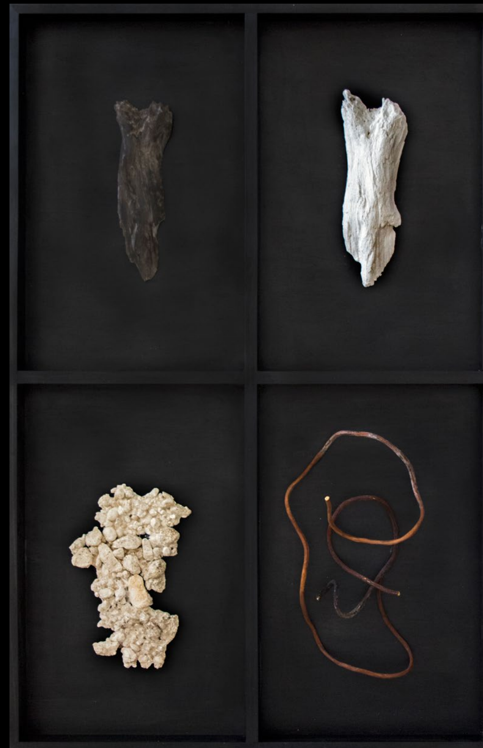
Four objects , mixed media, 36x24 " / 91x61 cm, 2018