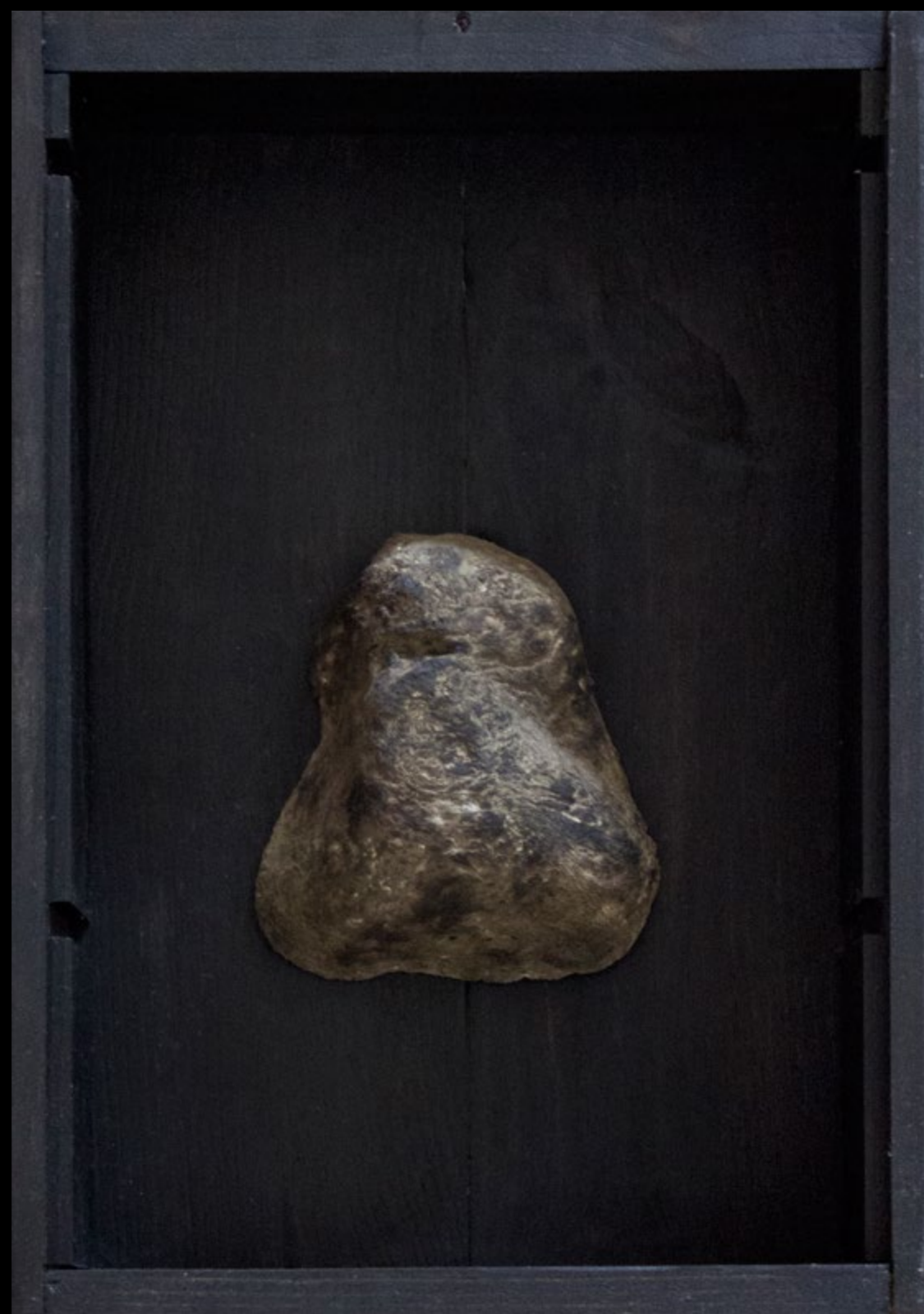
Petrify #07 Plaster cast in a wooden box, 10x15 " / 25x38 cm, 2018