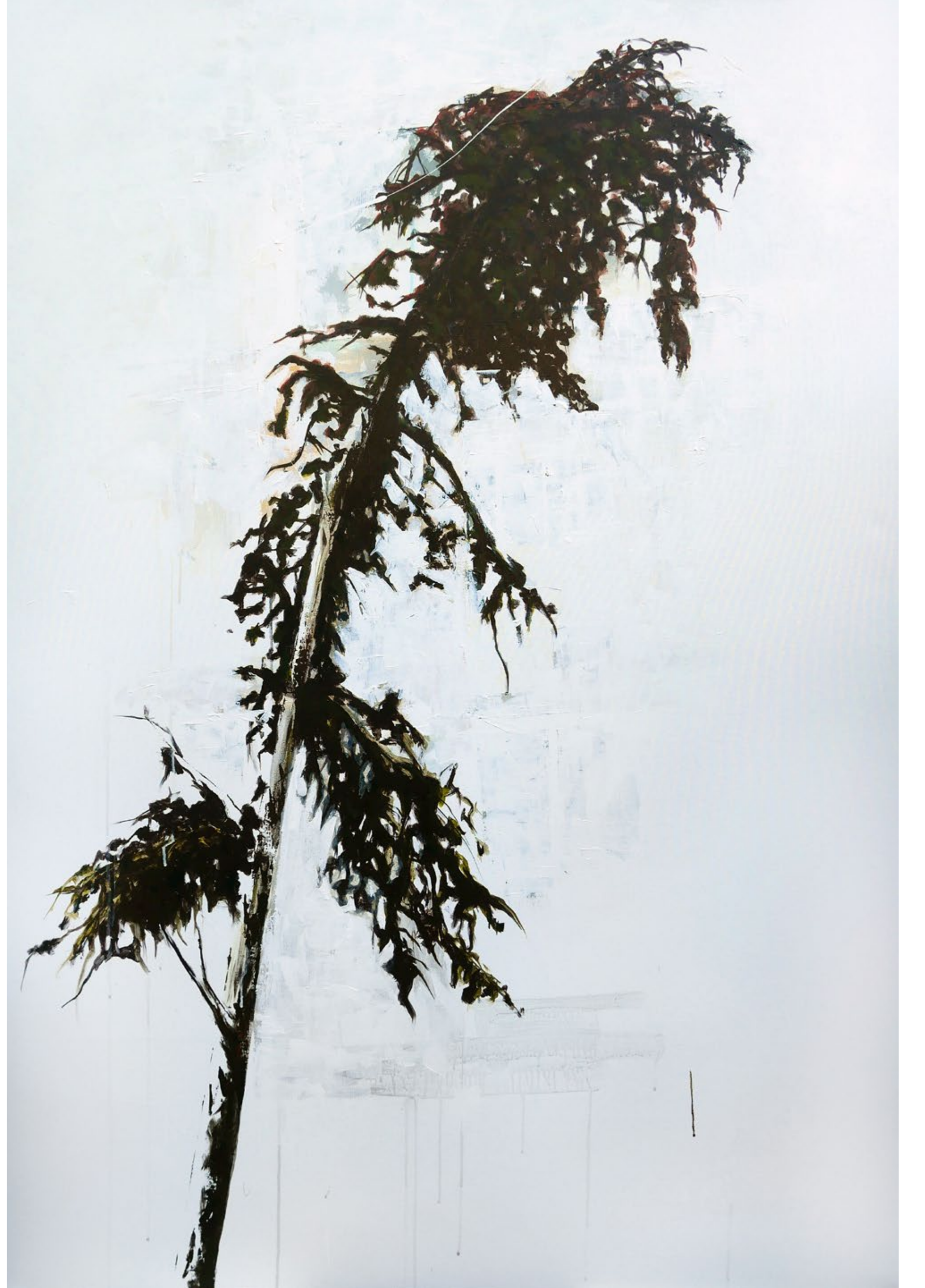
Tree #01 Acrylic on canvas, 72x48" / 122x183 cm, 2018