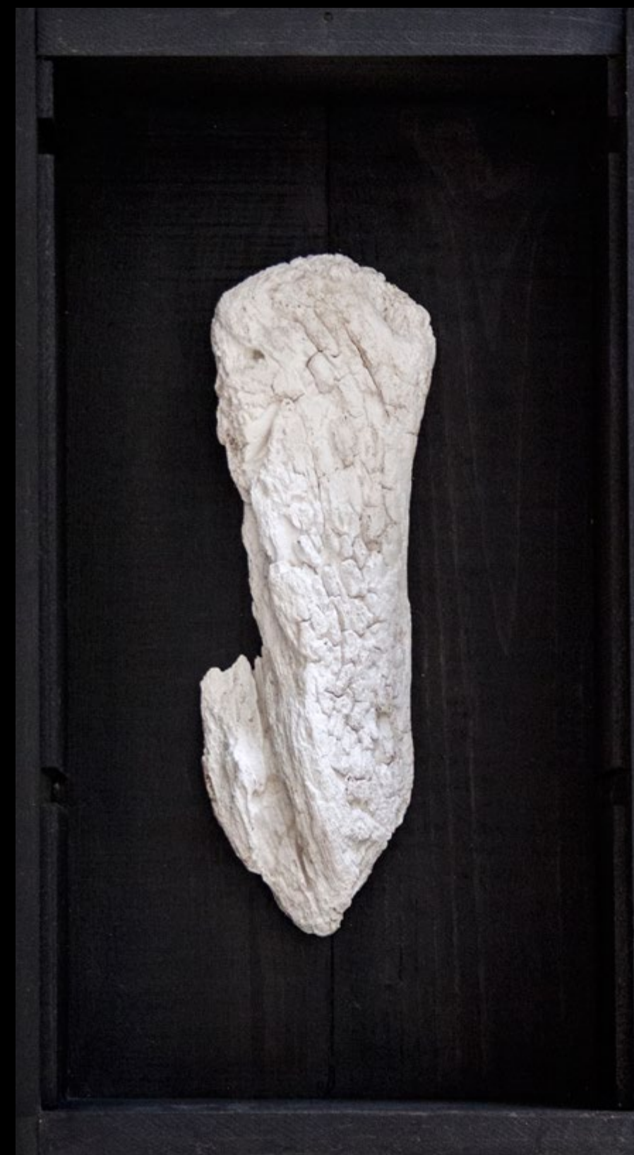
Petrify #05 / white Plaster cast in a wooden box, 10x15 " / 25x38 cm, 2018